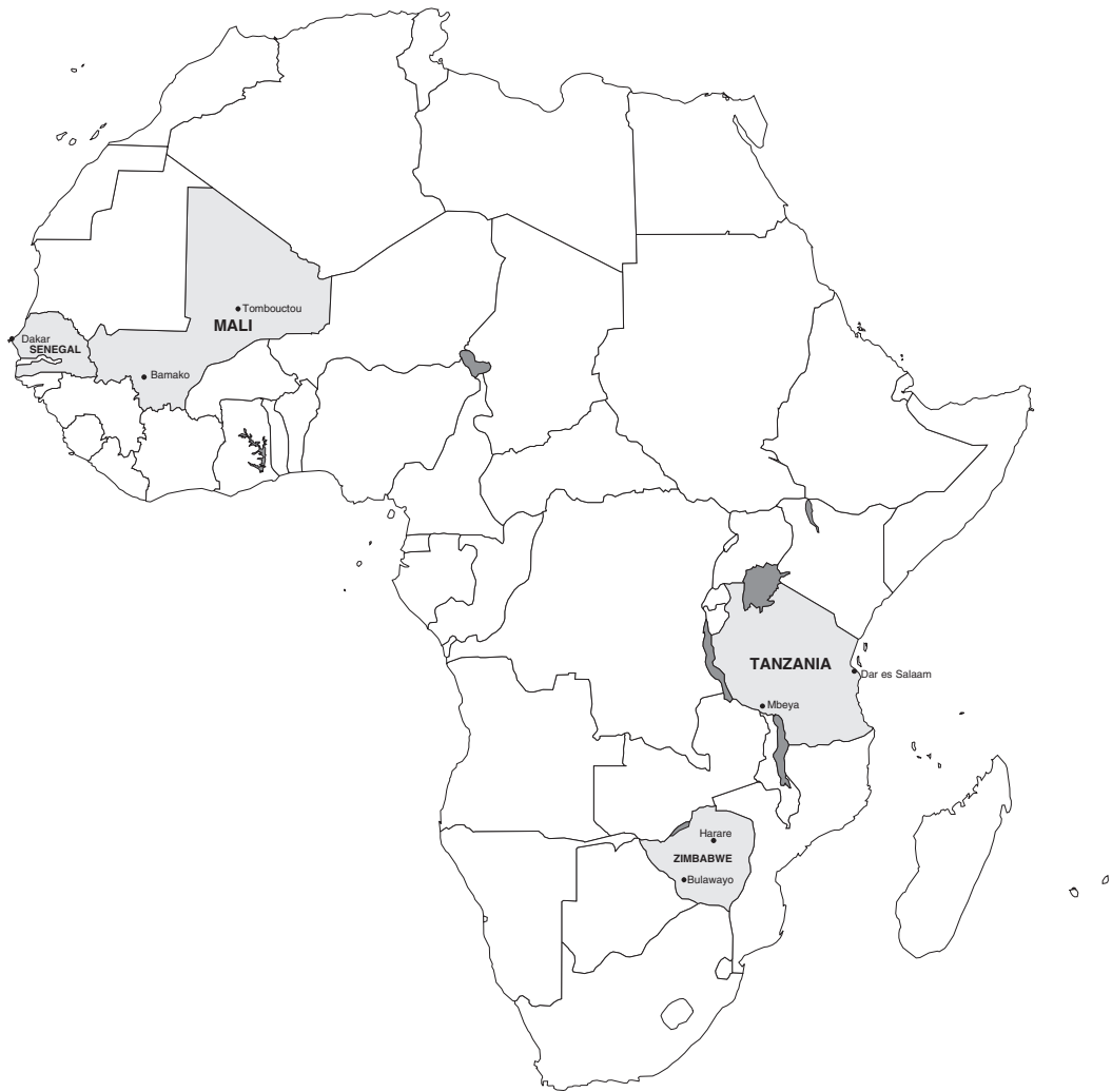
Figure 1: The four case-study countries